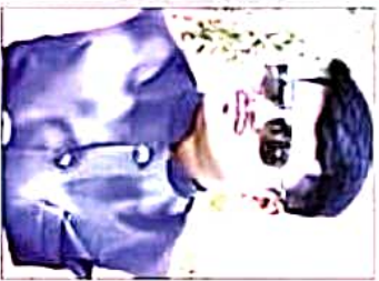
Dr. Dashrath V. Kale

Total 2 'Chapter in books' are published. Next 'Chapter in book' is in process.